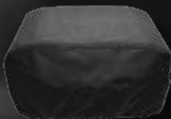
Weatherproof cover included