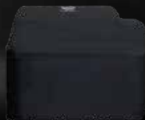
Weatherproof cover included