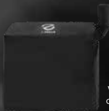
Weatherproof cover included